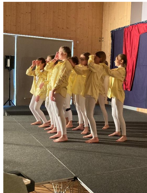
Dance Club (Footloose, Under Pressure, Teacher's Pet)