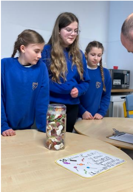
Interval fun run by the Primary 7s