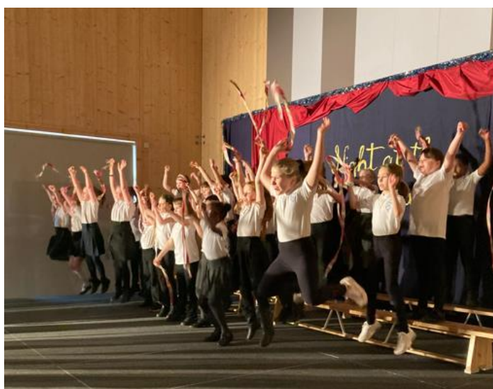
When I grow up & Revolting children P4 (Matilda)

We thought it would be nice to celebrate Kinellar's return to the stage with photos of the Night at the Musicals.