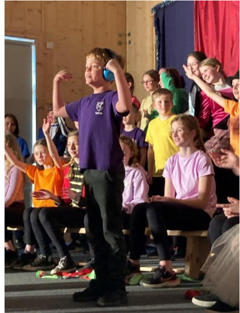
A Million Dreams & This is Me P6 (The Greatest Showman)